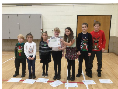
Santa Dash— Friday 8th December

On Tuesday we said goodbye to Foxy G as he/she headed their way to the next stage of their journey - having a plaque installed, being photographed and organised for the Standing Tall Trail in Cambridge . When we have further details about the trail we will let you know!